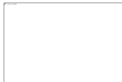
Immunohistochemistry of paraffin-embedded rat liver using CUL4B antibody at dilution of 1:200 (400x lens).