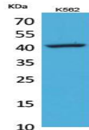
Western blot analysis of CD62L in K562 lysates using CD62L antibody.